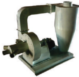
Sortex Dust Blower