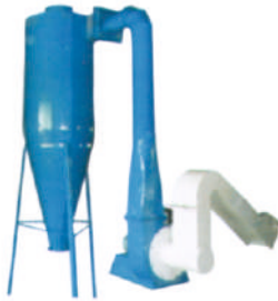
S-Band for Bran