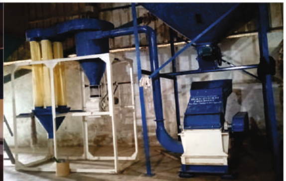
⑥ Husk Grinder Cap. 2 Qtl. to 1.5 TPH