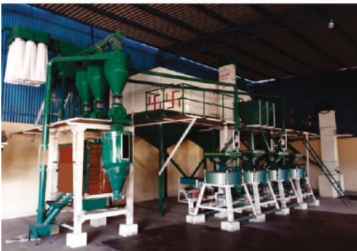
Flour Mill Plant Cap. 3 Qtl. to 2 TPH