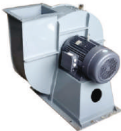
Rice Bran Blower

BEWSFS 18 Available in all Sortax Sizes With Dust Cleaner Fine Cleaner Elevator